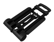
Pop Up Trolley #H_DS05019

Banners a division of Caldwell Marketing International 4CHURCHES.com